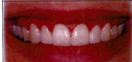
Gingivectomy / Crown Lengthening